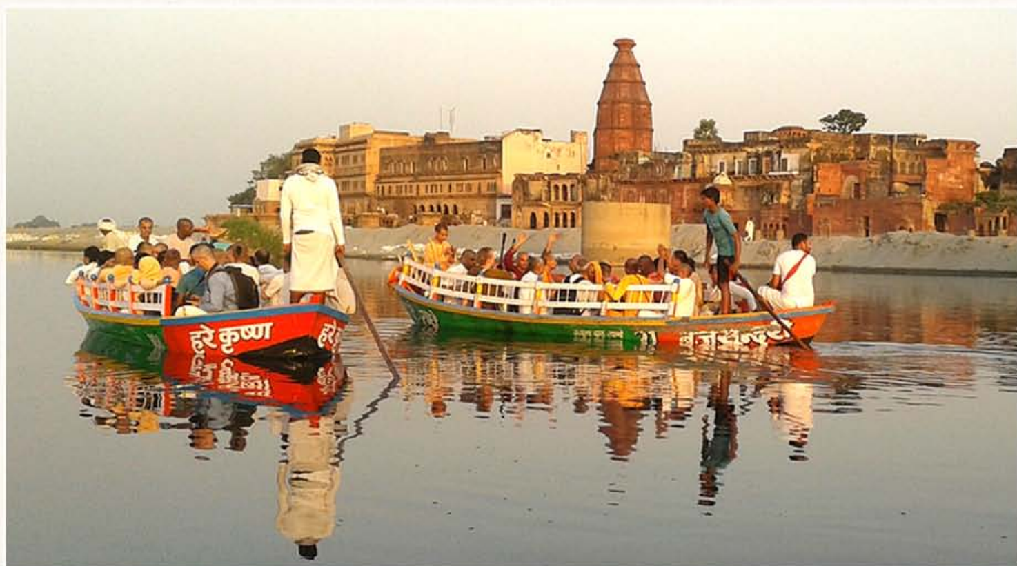
Boats approach Keśi-ghāṭa

The advance party had set up a beautiful altar in the sand, and Kṛṣṇa-Balarāma stood there, welcoming us. As soon as we got off the boats, local Vrajavāsī children with cute faces tried to sell us tiny floating leaf cups to be given to