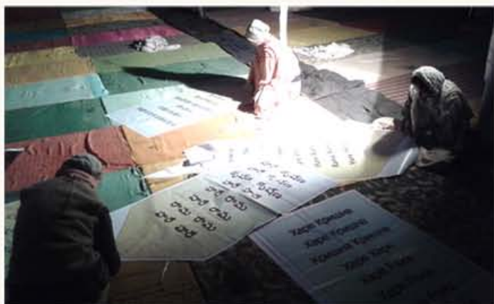
Decoration night shift

The VIHE holds two retreats in a row with a three days’ break in between. On the off days, staff members, about 40 of them including myself, took the opportunity to go to Rādhā-kunḍa to visit this most sacred place and chant japa together in the early morning’s sunrays near Śrīmatī Jāhnavā-mātā’s sitting place. At Śrīla Jīva