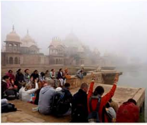
Early morning kathā at Kusuma Sarovara

Hare Kṛṣṇa Hare Kṛṣṇa Kṛṣṇa Kṛṣṇa Hare Hare Hare Rāma Hare Rāma Rāma Rāma Hare Hare