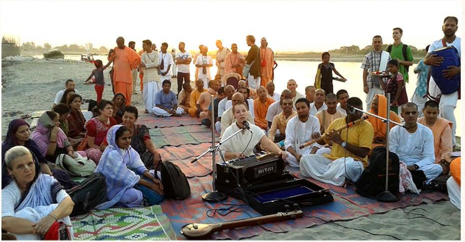
Kirtana at Keśi-ghāṭa at sunset

Yamunā to dance on her waves. But we had prepared our own! Soon the sound of the harmonium, flutes, karatālas, tampura and mṛdaṅgas filled the atmosphere. The Market Place of the Holy Name opened and everyone began to buy according to the price they could pay. The little children proved rich! Distracted from their business they began to sing and draw beautiful flowers and other shapes in that very special sand. Looking closer at it, we could see two colors – Śyāma and Gaurī. Indeed, some of the grains of sand looked black and some golden. Singers led, one after the next. In between the mahā-mantra we called out, “Jaya Rādhe! Jaya Kṛṣṇa!” in response to the Śrī Vraja-dhāma-mahimāmṛta of Śrīla Kṛṣṇa-dāsa Kavirāja Gosvāmī.