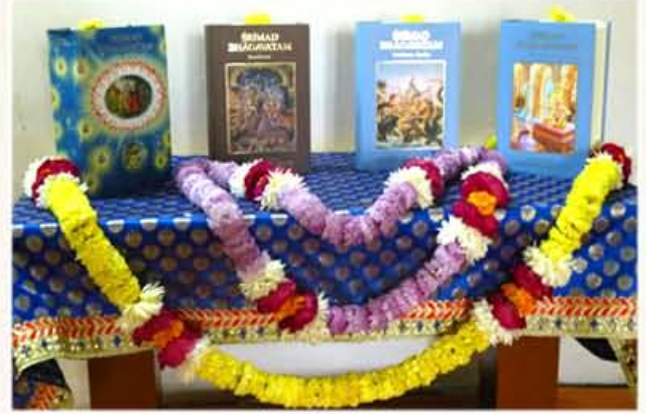
The Worship of Śrīmad Bhāgavatam

Part of the assessment consists of oral presentations lasting from twenty minutes in Canto 1 to one hour in Canto 6. Through these students learn how to present the philosophy and message of Śrīmad Bhāgavatam to various audiences. Stress is put on applying the teachings in one’s own life and evolving a