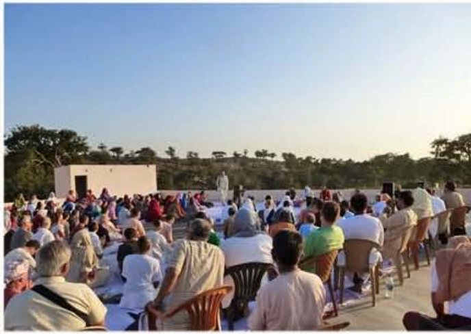
Govardhana Retreat opening