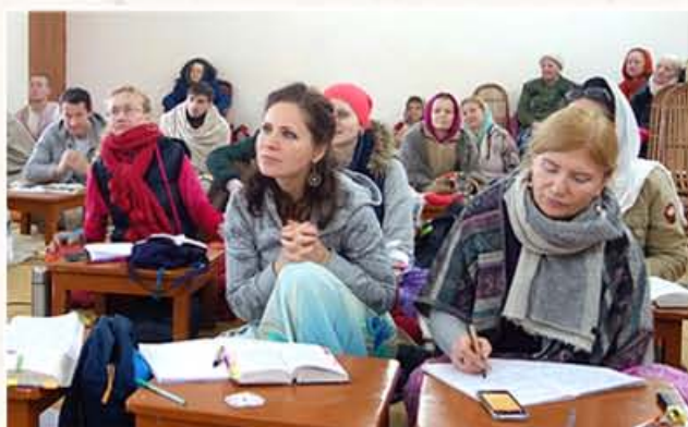
Russian-speaking students in rapt attention

Russian Bhakti-śāstrī students feel honored and excited to be part of the first batch of this