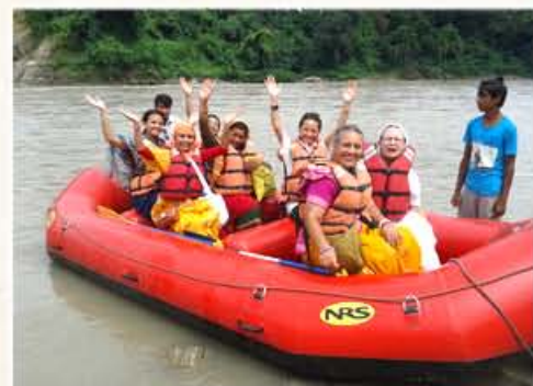
Ready to venture across the Sapta Gandaki