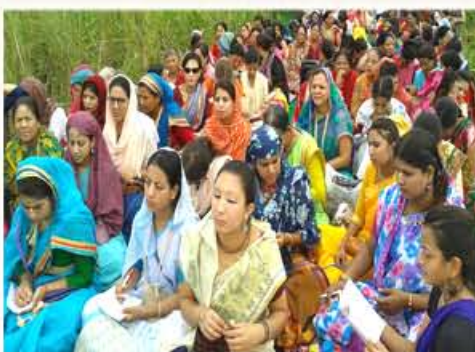
165 devotees attend the Retreat