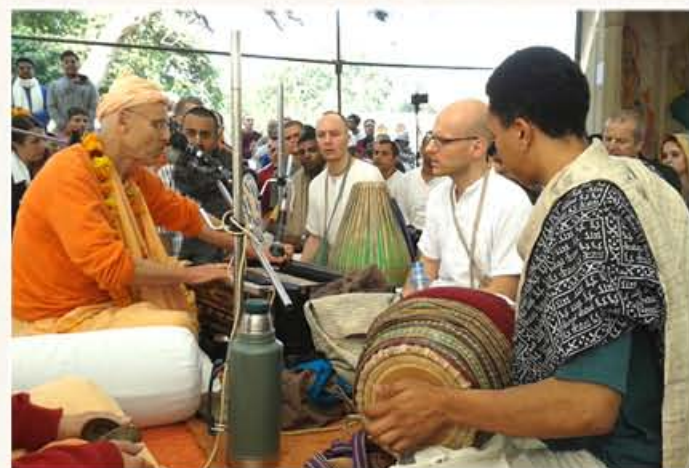
Kirtana at Surabhi Kunḍa